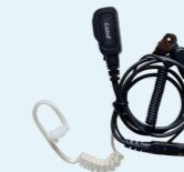
Audio tube Earpiece